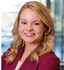
Bailey Box Indianapolis Office